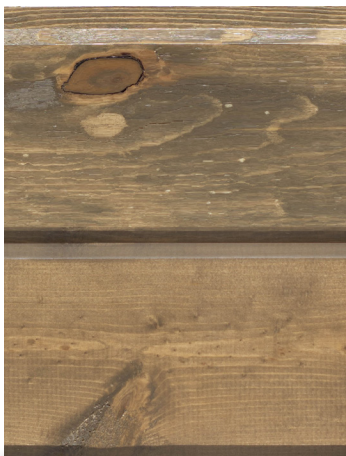
Pine Paneling in Pewter