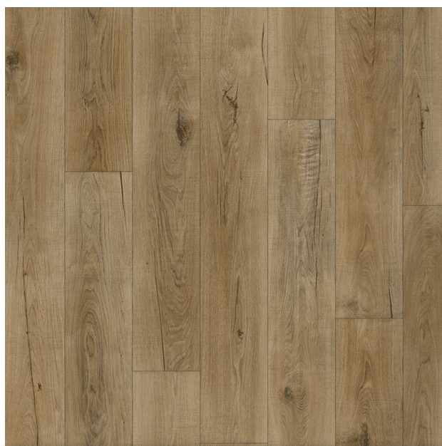
Flooring Throughout: Congoleum Vinyl in Natural