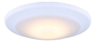
Lighting: LED Throughout