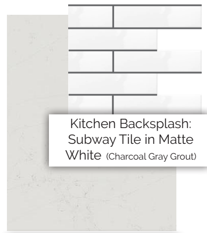
Quartz Countertops in Altena