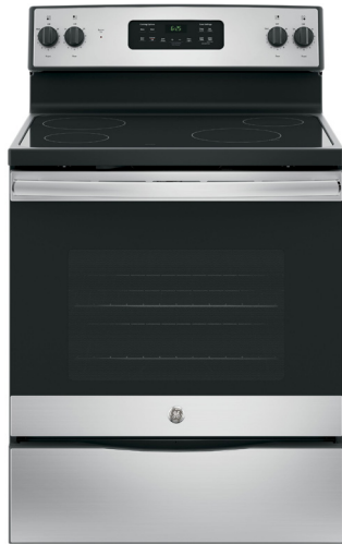
30" Free-Standing Electric Range, Glass Cooktop, Self Clean JB625