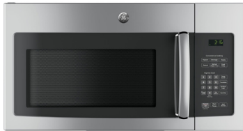
Over the Range Microwave 1.6 cu ft, 300 cfm, 950 watt, Recirculating Venting JNM3163