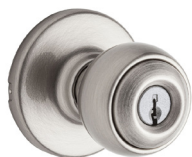
Door Handles: Standard Nickel Knob