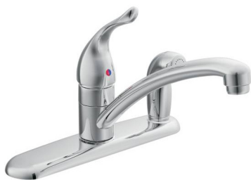
Plumbing & Faucets: Chrome

The Foothills Package is an affordable addition to our Classic Series. Refer to Classic Series brochure for all available floor plans.