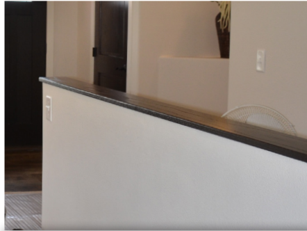
Stairwells: Half wall or full wall