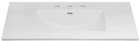
Vanity Top: Wave Bowl in White Cultured Marble