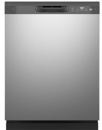
Dishwasher 4 Cycle GDF511