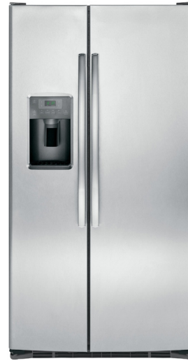
Refrigerator 25.3 cu ft, Side-by-Side, Ice & Water GSE25