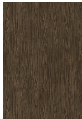
Cabinets: Flat Panel Doors in Tete a Tete