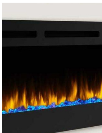
Fireplace: Simplifire Allusion Electric