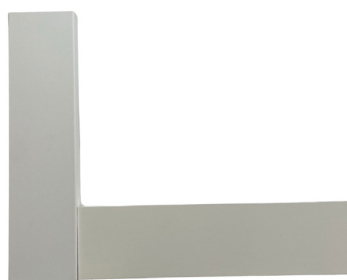
Moulding: MDF 4.25" Baseboards & 3" Casing in White